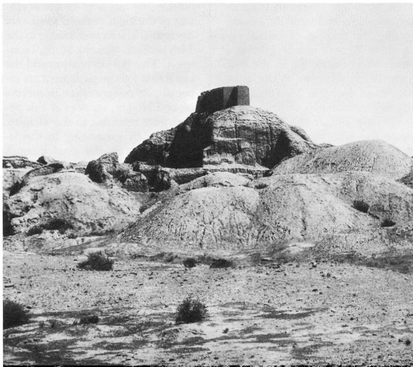
The Ekur ziggurat at Nippur showing the area to the north (at left) where new trench is planned to investigate early levels.

In thinking of digging to the early levels, we must prepare to deal with a high water table. Increased irrigation around Nippur, supplied by development projects that have transformed southern Iraq in the past fifteen years, has resulted in a much higher groundwater level than at any time since Chicago began to dig at Nippur (1948). In the early 1970s, before the completion of reservoirs and irrigation schemes, we could excavate to at least four meters below the present plain before we encountered water. In some years, when there had been little rain, we could reach six meters below the plain.