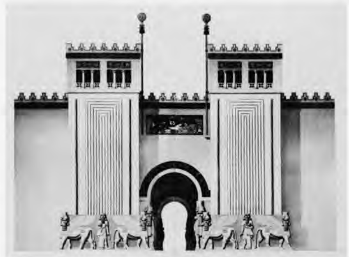
19th Century reconstruction of the main entrance to the throne room at Dur-Sharrukin.