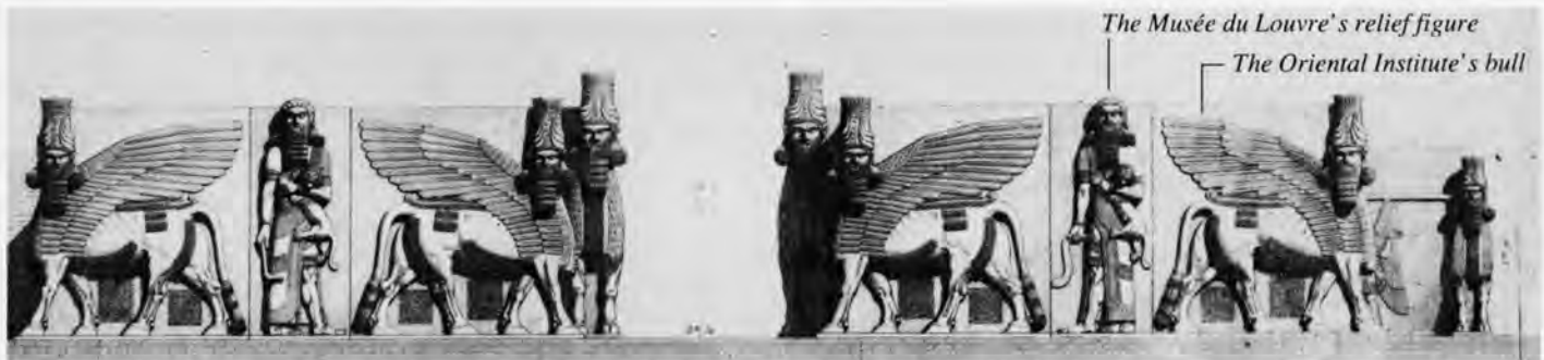
Detail of a reconstruction of the southwest wall of Court VIII in Sargon II's palace at Dur-Sharrukin. P.E. Botta and E. Flandin, Monument de Ninive I (Paris, 1849), plate 30.

The correspondence of Assyrian kings, including Sargon II himself, abounds with references concerning the carving and transportation of colossal sculptures such as ours. We are adding an exciting epilogue to those ancient records – a story that will unfold in the months to come.