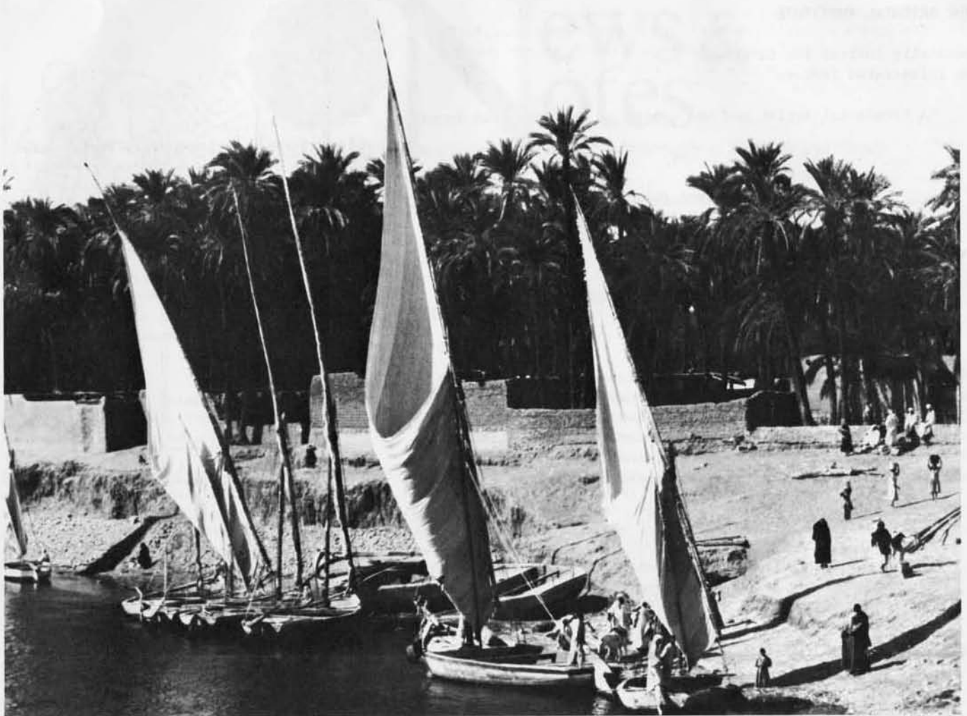
Feluccas on the banks of the Nile—photo taken on last year's tour