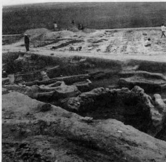
Gully Cut Extension showing Middle Susiana structures, foreground; Early Susiana walls, to the left; avenues of the Gully Cut Sherdyard.