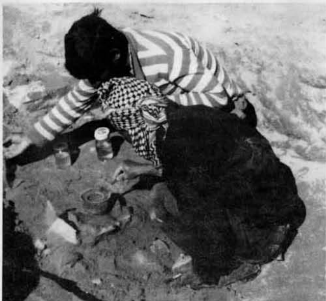
Discovery of a pair of nested bituminous stone vessels of c. 6000 B.C. in the Trench XXI area.

briefly, area by area, beginning with the smallest one, that of Trench XXXVII.